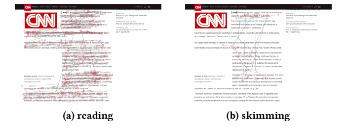
Figure 1: Scanpaths from two subjects tasked with a) reading and b) skimming an article from cnn.com/health. Reading behavior is characterized by horizontal saccades with a small vertical return movement. Skimming is characterized by less organized rightward saccades and occasional large vertical leaps throughout the document.

Gregory Zelinsky Stony Brook University Stony Brook, New York