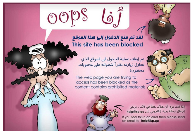
Figure 3: Example block page from Qatar.