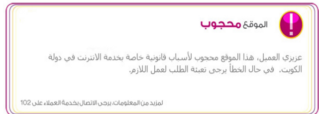
Figure 2: Example block page from Kuwait.